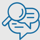
Qualitative Comparative Analysis