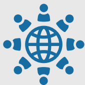
Culturally Responsive Evaluation (CRE)